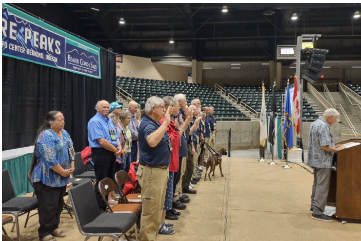
Swearing in of FMCA Officers