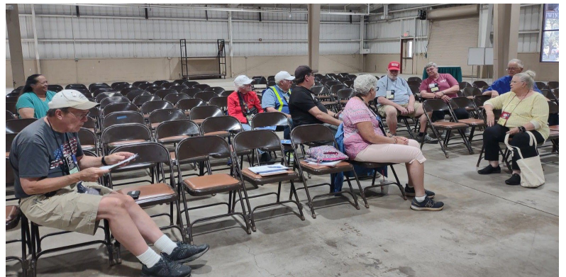
Eastern Area Caucus meeting