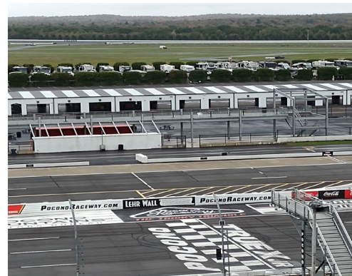
Picture of the racetrack with RVs on the infield