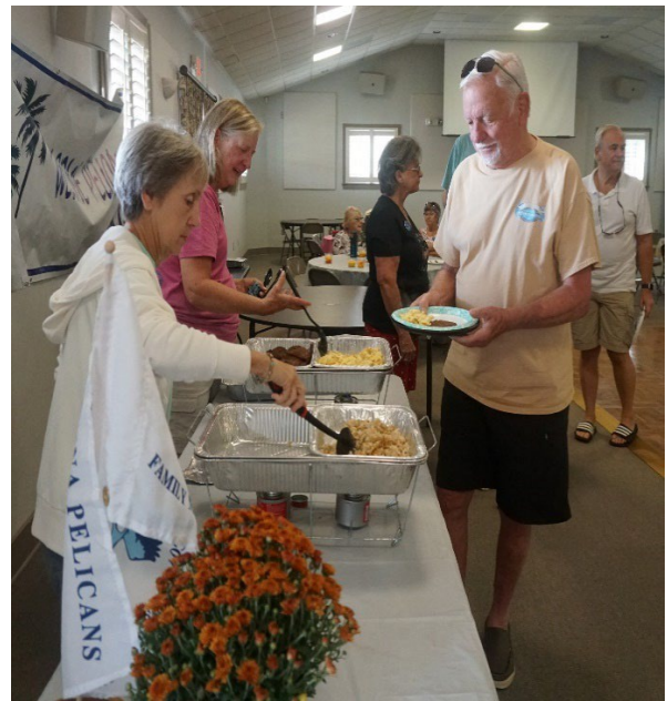
Always Food at rallies