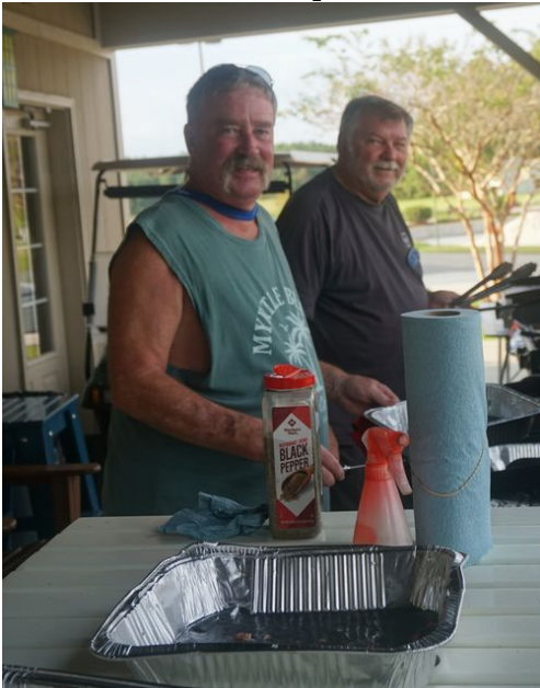
And who could forget the cooks!