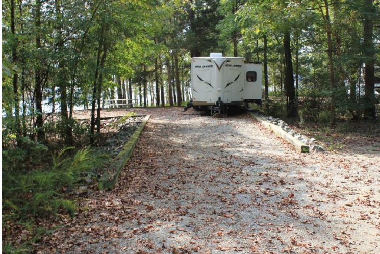
Campsite at Rudds Creek Campground, Buggs Island/Kerr Lake