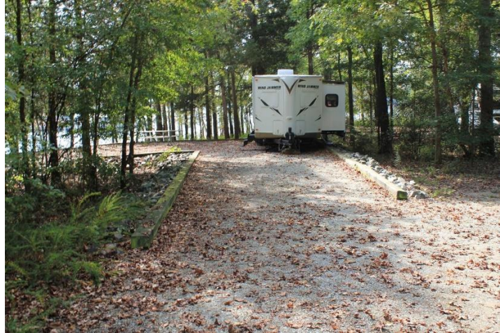
Campsite at Rudds Creek Campground, Buggs Island/Kerr Lake